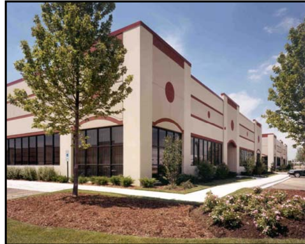
TECHNOLOGY & VANTAGE DRIVE - ELGIN